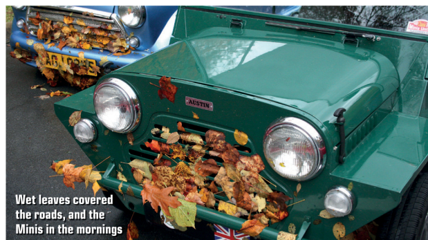
Wet leaves covered the roads, and the Minis in the mornings